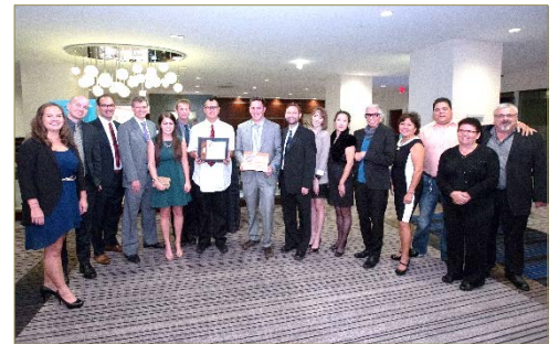
The Inlailawatash crew at the BC Aboriginal Business Awards